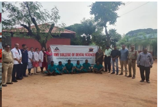
Dental Camp at Central Jail, Cherlapally,Hyderabad