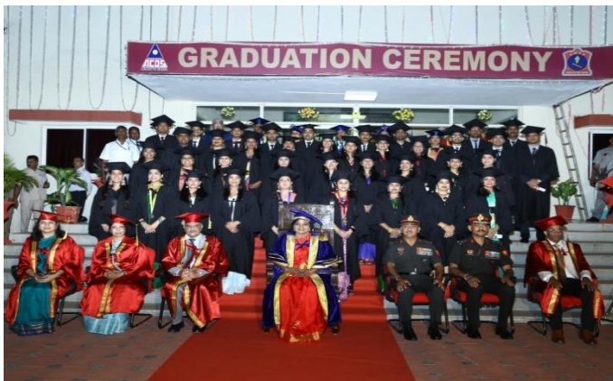
Graduation Ceremony 2022-23