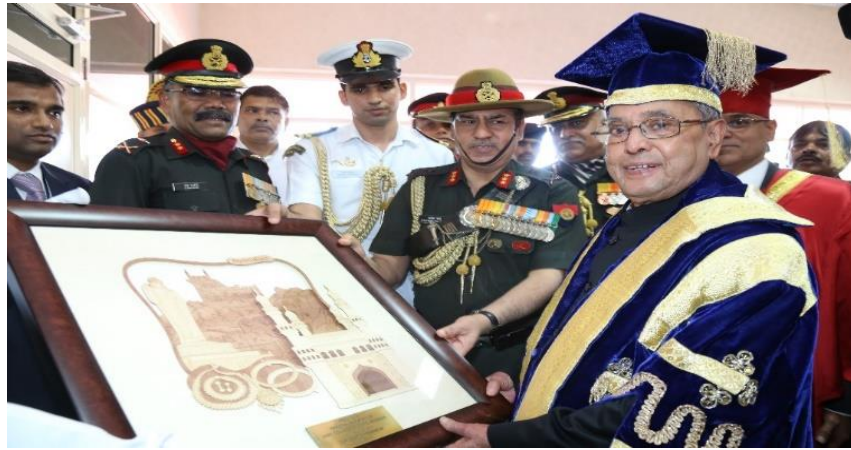
Former President of India H.E late ShriPranab Mukherjee