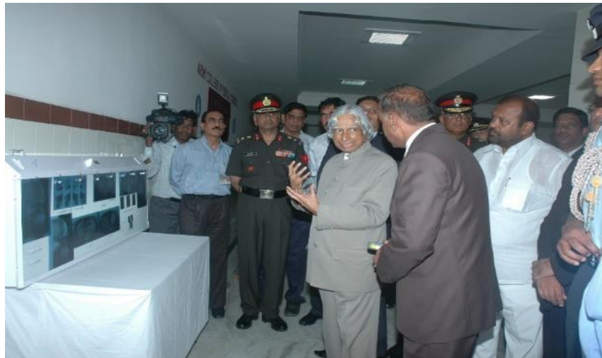
Former President of India H.E late Dr APJ Abdul Kalam